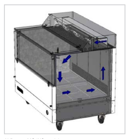
Airflow on MC4NS model

Cold Wall and forced air technology allows optimal cooling, keeping milk products cold prior to serving.